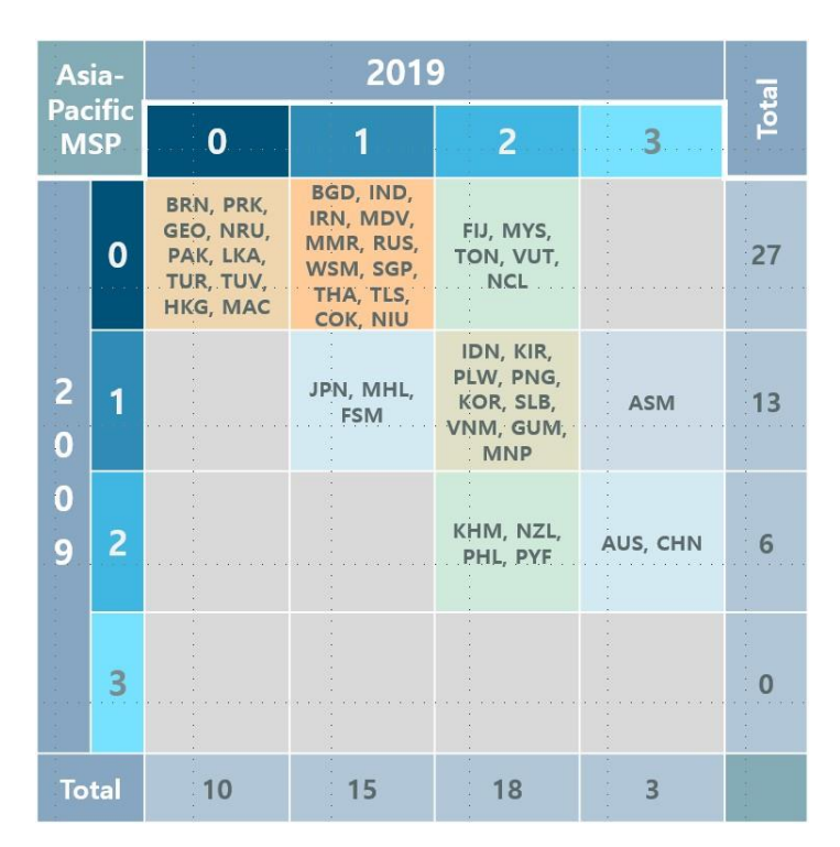
FIGURE 3: ASIA-PACIFIC MSP CHANGE MATRIX BETWEEN 2009 AND 2019 (BY COUNTRIES)

in AUS's GBRMP<sup>34</sup> and in CHN's MFZ<sup>35</sup>, while adaptative management, long term vision, and stakeholder engagement could also be found in many of these Stage 2 planning efforts.